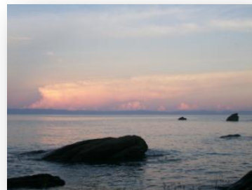
← Lake Malawi

3. Lake Malawi (situated between Malawi, Tanzania and Mozambique) is the 3 rd largest lake in Africa and the 8 th largest in the world, so although Malawi is landlocked it still enjoys a huge coastline.