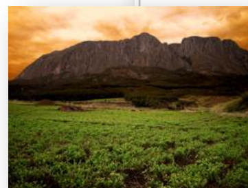
← Mount Mulanje

5. Its population is approximately 14 million making it one of Africa's most densely populated countries. 85% of the population are living in rural areas rather than cities. Malawi currently has 4 cities; England has 50!